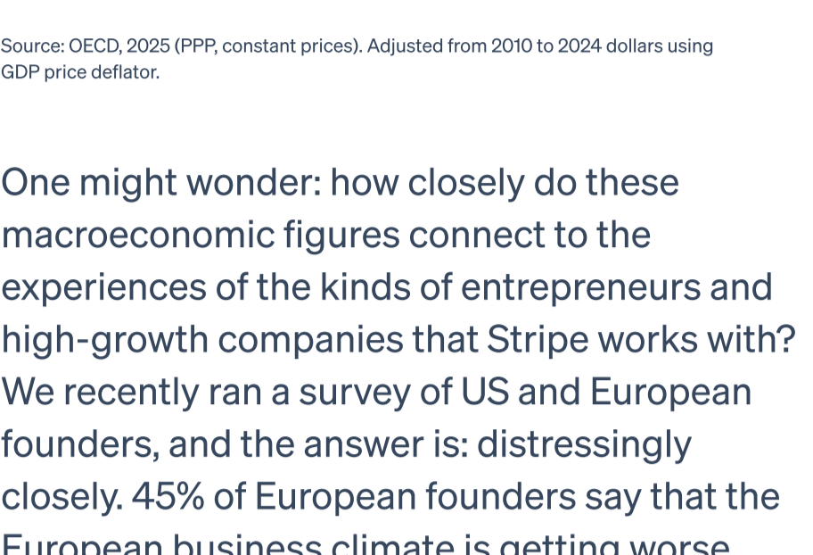
Source: OECD, 2025 (PPP, constant prices). Adjusted from 2010 to 2024 dollars using GDP price deflator.

In recent months, spurred significantly by Mario Draghi’s report for the European Commission, Europe’s economic challenges have come to the forefront of public discussion. While the economies of the US and Europe were similarly productive in 1990, there has since been a stark divergence, with US productivity per hour worked reaching $104, as compared with a plateau of something closer to $85 per hour in Europe. Contrary to popular belief, the European economy isn’t weakened because people take longer lunch breaks or because the continent takes the month of August off. 4 (European working hours have actually been increasing.) The European economy is challenged because it’s getting less output from each hour worked. In his report, Draghi appropriately describes this as an “existential challenge” for the continent.